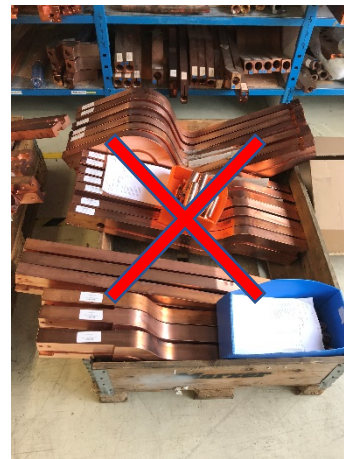
Protective net not used, load carriers not sufficiently dimensioned