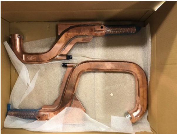
Components properly protected