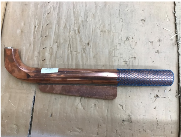
Protective net used, load carriers sufficiently dimensioned